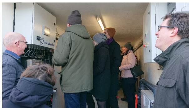
The pilot plant in Slagelse almost ready for operation