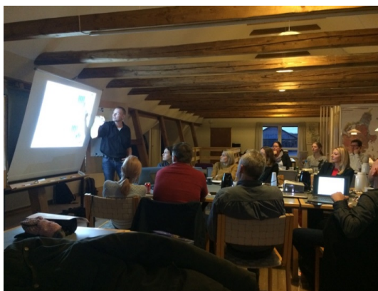
Ola introducing analysis of pharmaceuticals