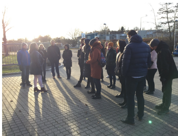
Guided tour at the Slagelse WWTP